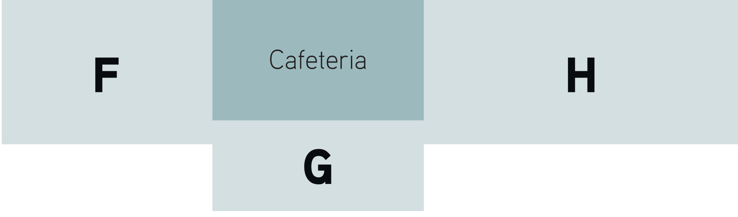
Second floor ● Available surfaces